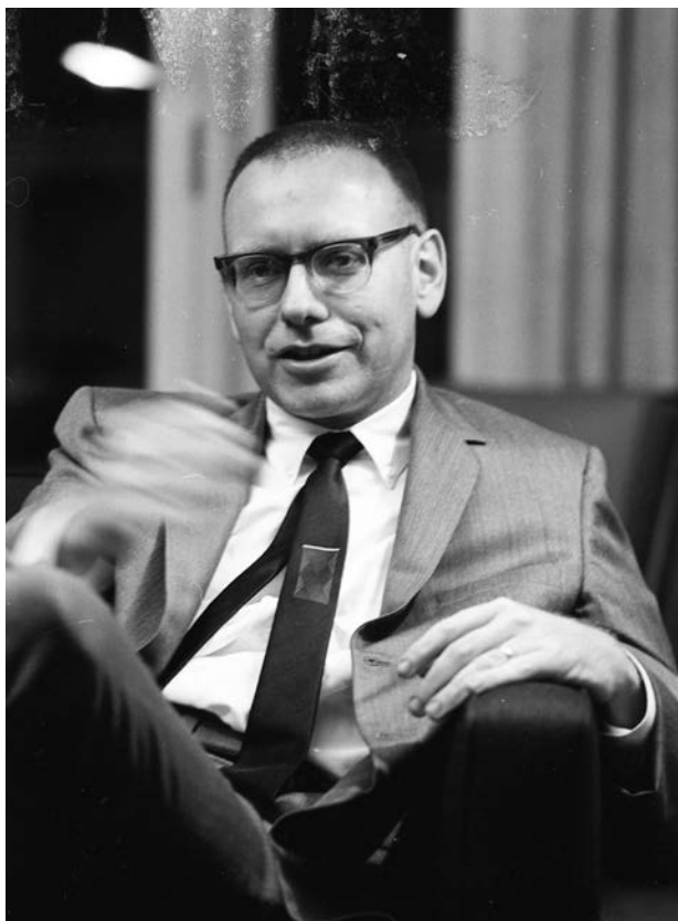
Photograph of Warren Buffett, dated July 1, 1965.

that.” With this lesson absorbed, it later led to some of his best buys as he sought companies with the most pronounced customer loyalties in their industries, such as Coca-Cola. But, at the time, the 22-year-old was smarting from losing $2,000 on petrol.