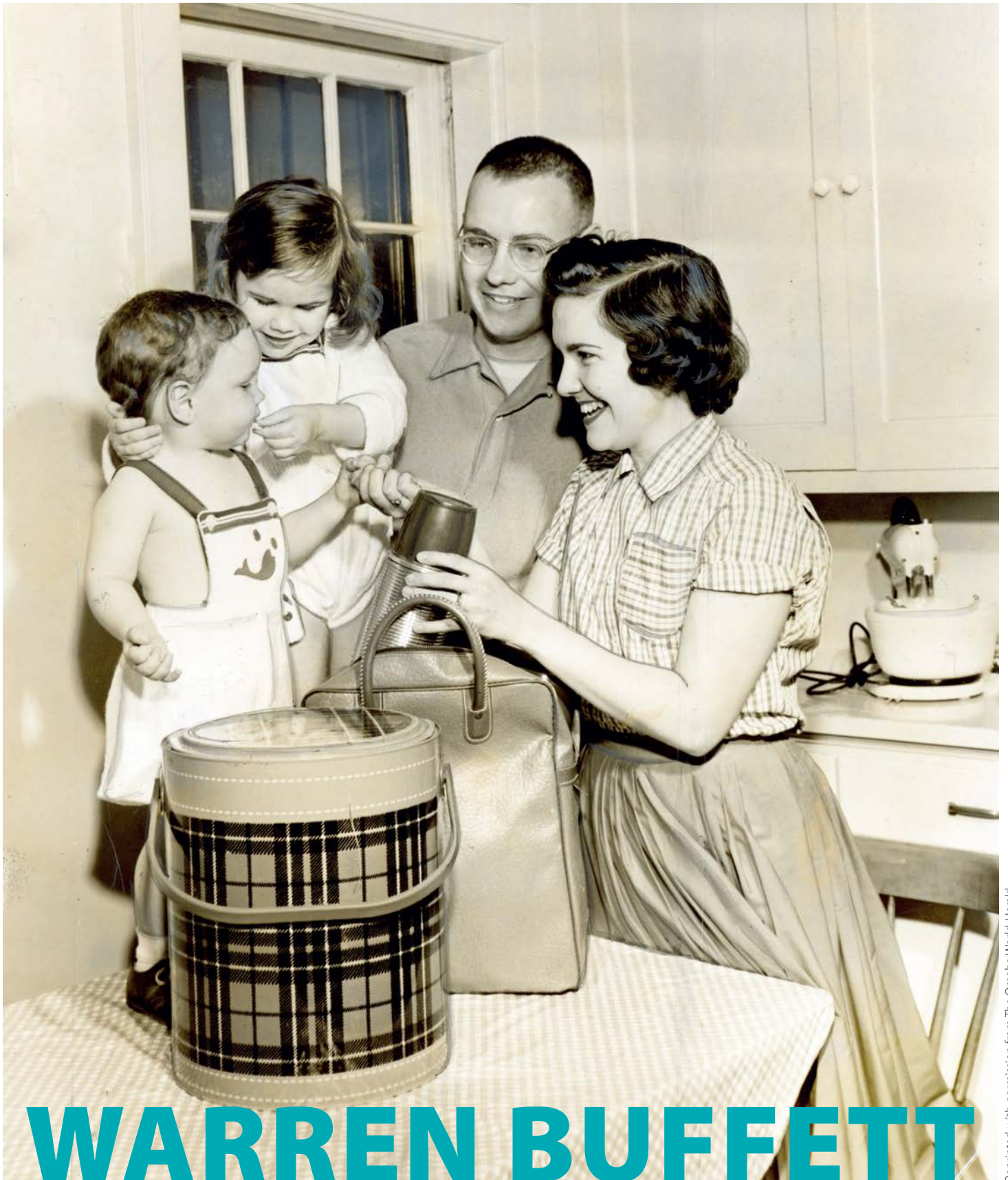
Reprinted with permission from The Omaha World-Herald